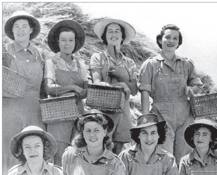
Above: Griffith, NSW. 1944. Ten women of the Australian Women's Land Army sitting down to lunch beside a water channel in a paddock, taking a break from picking peas.

The Women's Land Army Park in Yarran Street, Hanwood now features a fitness station, with six items installed including, back extension and stepper, tricep dips/leg lifts, upright exercise bike, lateral pulldown and chest press, sit up/push up benches and leg press and cross trainer.