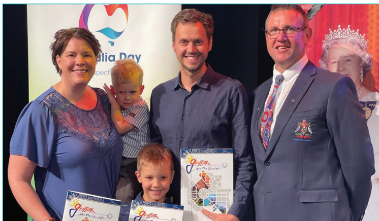
The Oppermans were among the 64 new citizens welcomed on Australia Day.