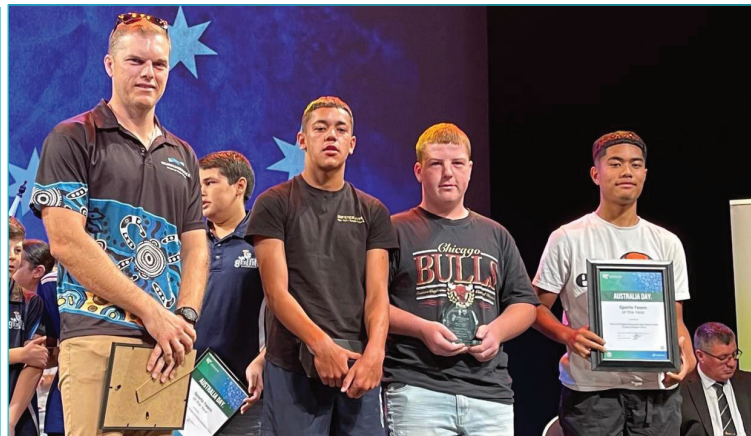
Sports Team of the Year - Murrumbidgee Regional High U14s Rugby League Team.