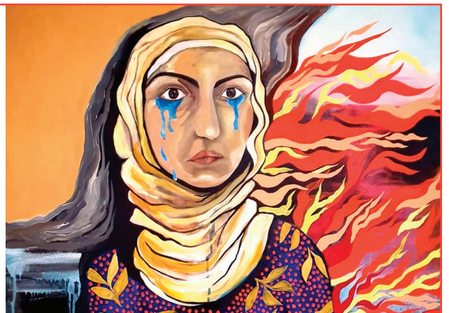
The Cad Factory is supported by the NSW Government through Create NSW.

Artists from diverse cultural, generational, personal and artistic perspectives illustrate and celebrate the complexity of contemporary feminist discourse and the art made within it.