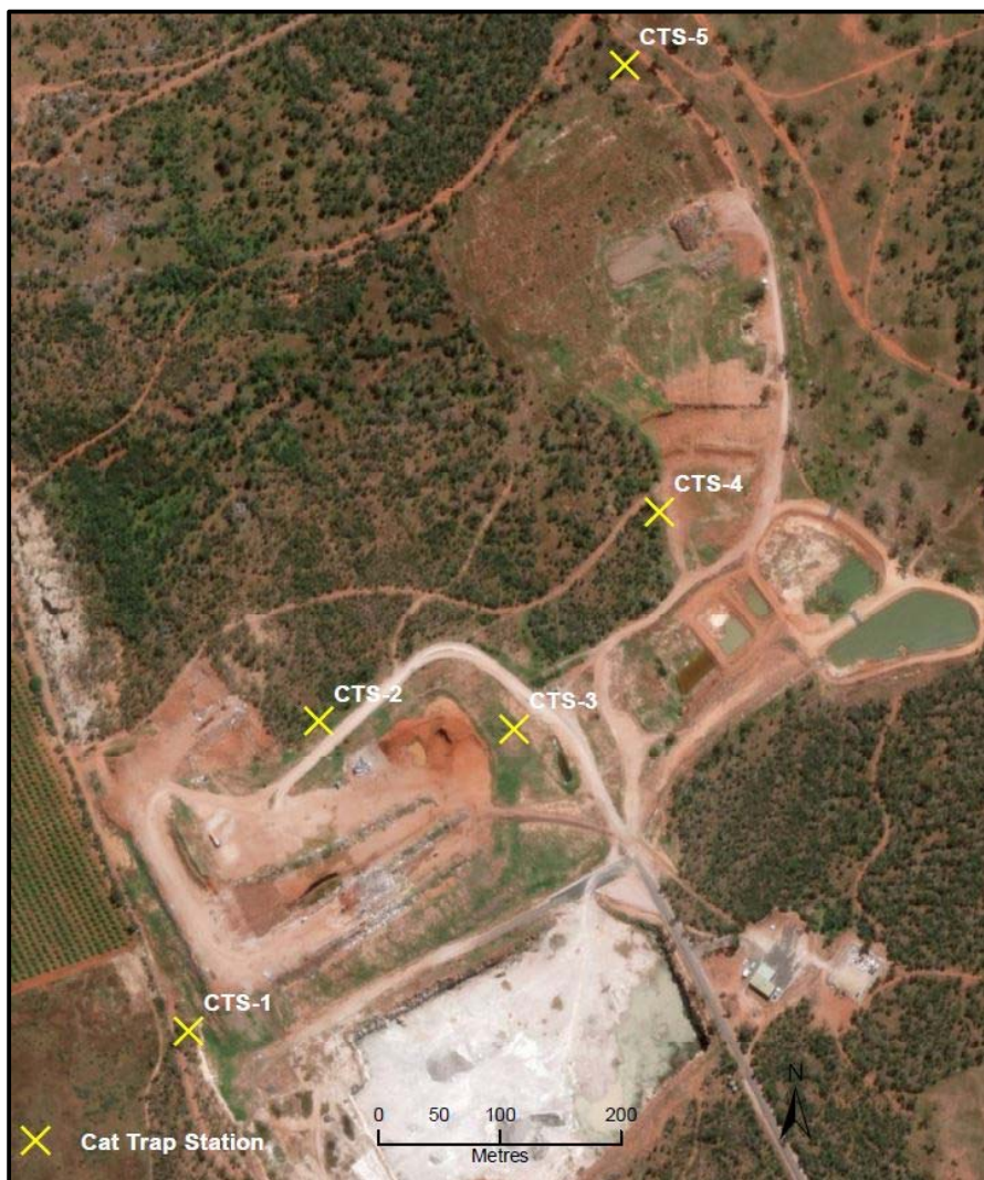
Figure 5: Cat Trap Sites

Neighbours (as listed in Annexure 1) should be notified in writing using the letter in Annexure 2, three days prior to any feral cat trapping activities so they can take action to protect any domestic cats. Trapping is most effective at night so domestic cat owners should keep their pet cats indoors from dusk until dawn whilst trapping is being carried out.