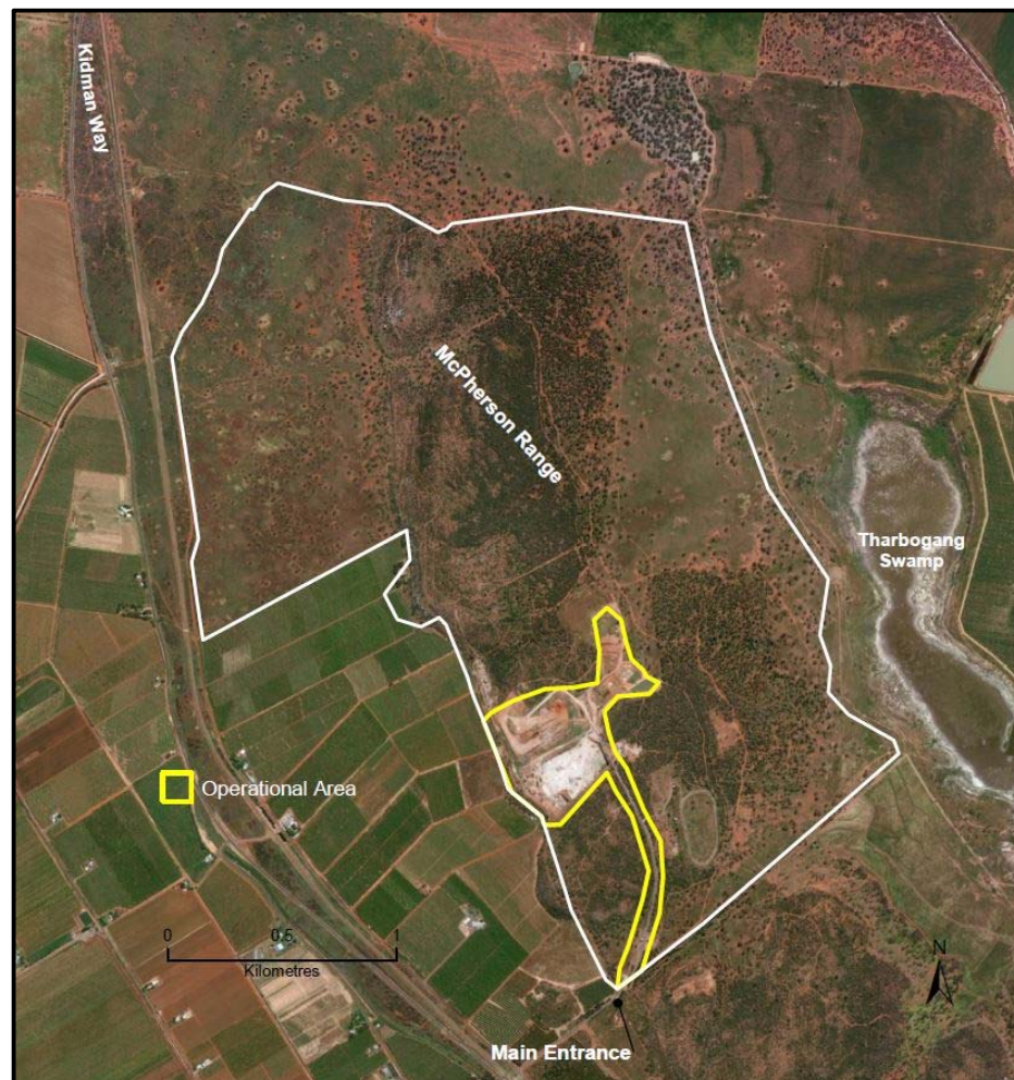
Figure 2: Tharbogang Waste Management Centre

The site is about 608ha and depicted in Figure 2. The topography of the site is low hills, which are part of the McPherson Range; the site reaches a maximum elevation of 180m AHD 1 , falling away to the east and the west boundaries to 125m AHD.