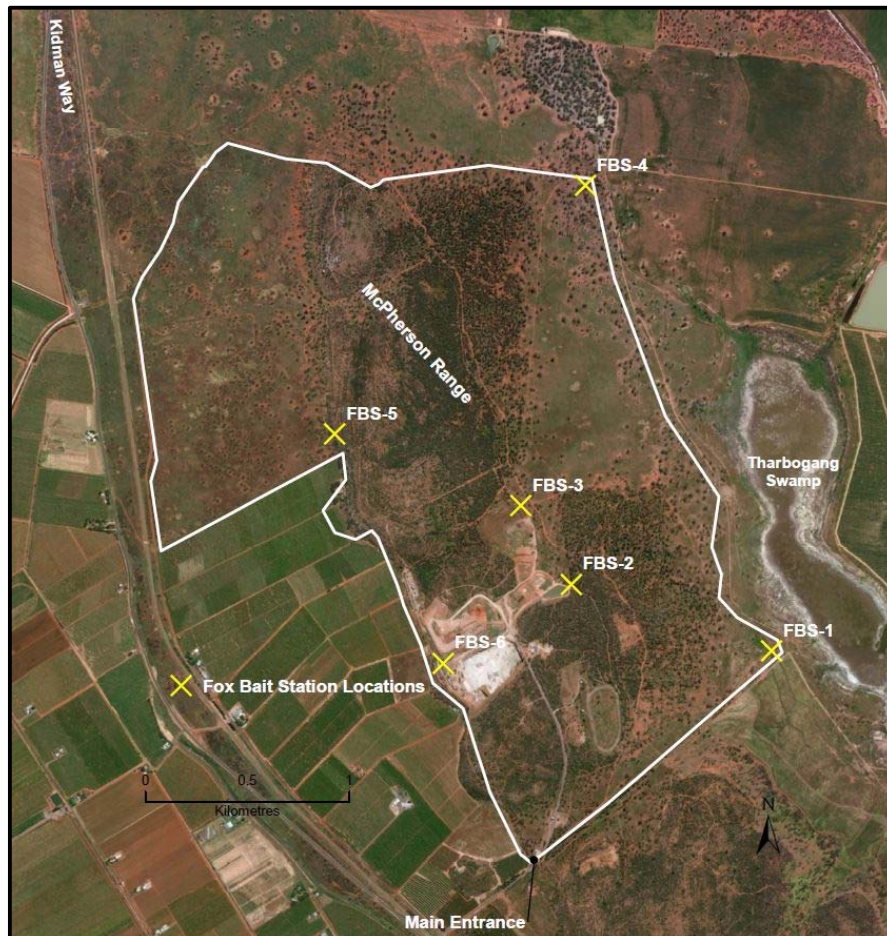
Figure 3: Fox Bait Sites

Six baiting locations (bait stations) across the site are recommended, and Figure 3 indicates proposed locations of these bait stations across the property. The location of these bait sites should be modified as required subject to the outcomes of baiting programs. Bait stations should be monitored with motion activated cameras to record all activity at each site. A camera record sheet is included as Annexure 4. Contractors shall provide footage to Council of positive sighting of pest animals within the control period.