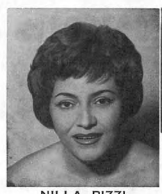
NILLA PIZZI ncitrice dell'ultima edizione di "Canzonissima"