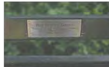
Recognition or remembrance