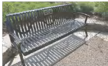
Sponsor a public bench

Another option might be to look to civic crowdfunding to fund various projects.