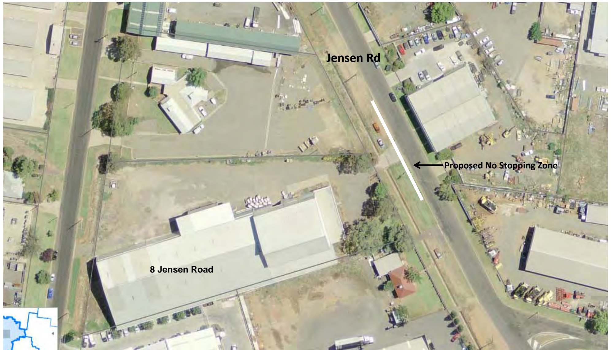
(a) Plan of Jensen Road - Proposed No Stopping Zone